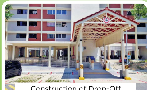
Construction of Drop-Off Porches at Blk 403, 404, 405 Bedok North Ave 3